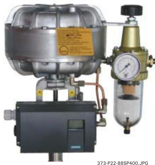
Fig. 219 baelz 373-P22-88-SP400 pneumatic actuator with digital positioner baelz 88-SP400 and air pressure reducing set baelz 54298