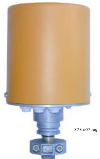
Fig. 181 actuator baelz 373-E07

Rights reserved to make technical changes